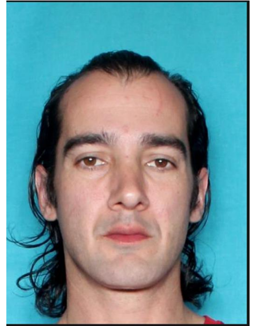
Picture of Subject